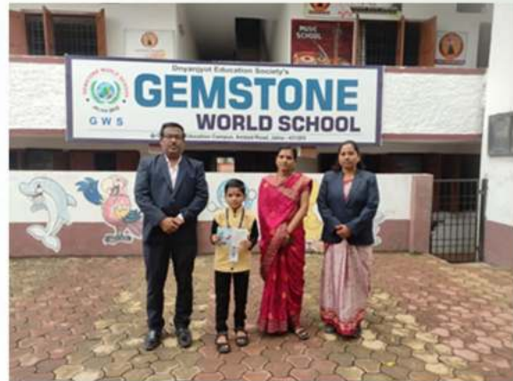
Class- 2nd Rudra Bayas